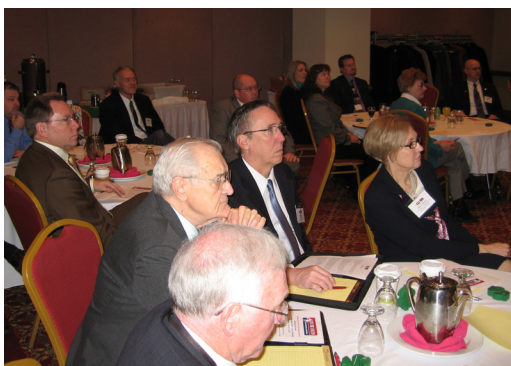
Credit Union Leaders attend 2010 Jam the Unicam.